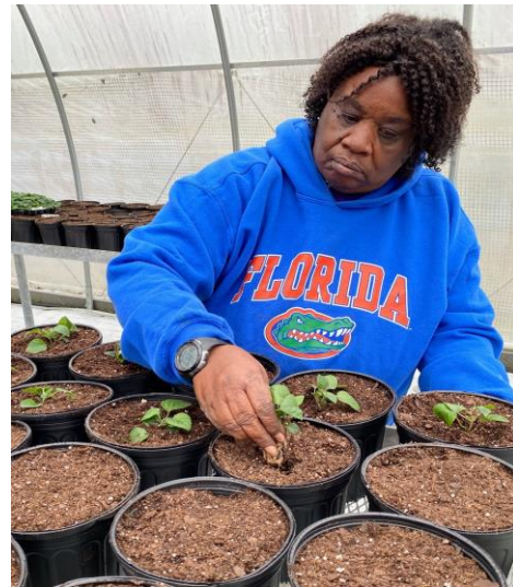
Little plants will be ready for your colorful spring gardens soon!

February is Black History Month, and we recognize the history and honor the achievements that promote a more inclusive society for all. GROW-HUB is an inclusive work environment. We actively work to overcome barriers to employment, and we value treating everybody with the respect that they deserve.