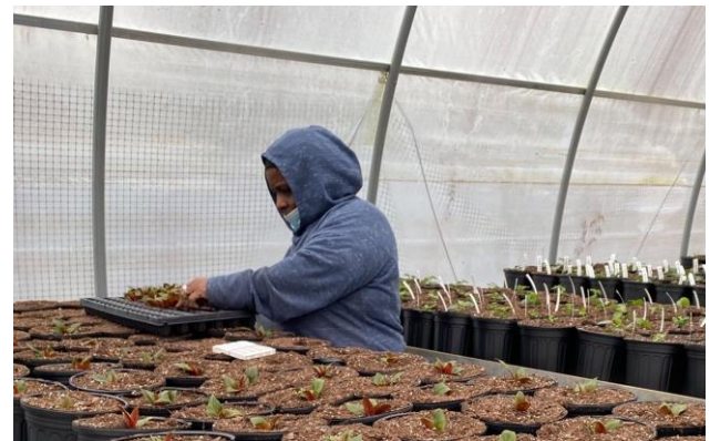
Donations help cover our costs so that all plant sale proceeds directly benefit our workers and programs.