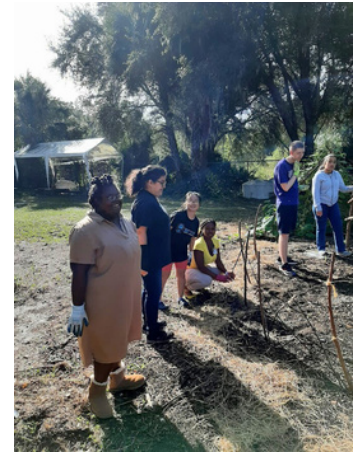
Horizon Students working on the Friendship Garden at GROW HUB.